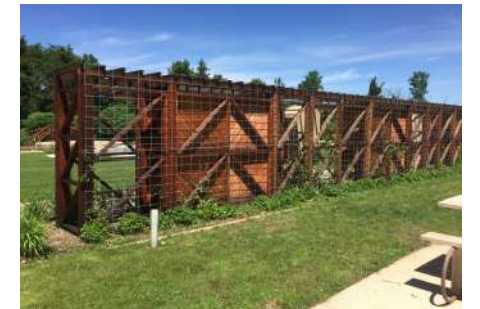
Continued work in the Prayer Garden!

We are glad to have you here today! If you wish to register at St. Nicholas, please call the church.