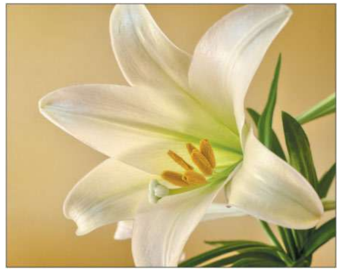
Thank you for your donation, and may your loved ones rest in the peace of Christ.