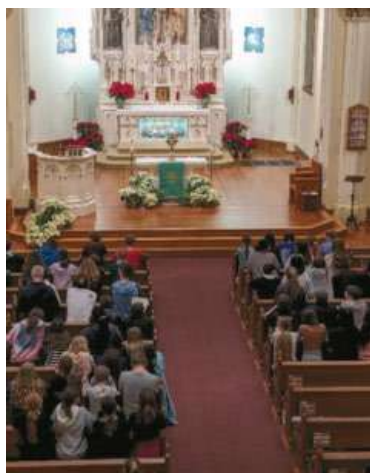
Chill Fest 2024 Adoration