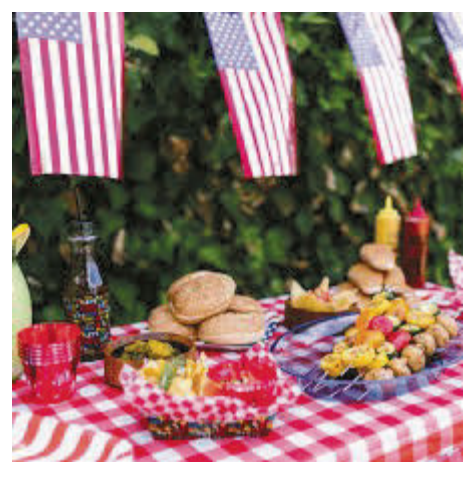
Wednesday, June 14<sup>th</sup> 5:00pm – 6:30pm St. Francis Hall