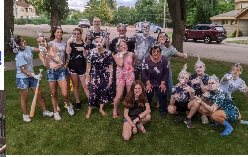
Grades 7-12: Sunday, June 11<sup>th</sup> – Thursday June 15<sup>th</sup>

Grades 1-6: Monday, June 12<sup>th</sup> – Friday June 16<sup>th</sup> REGISTER by May 10<sup>th</sup> for your Totus Tuus 2023 tee-shirt Brochures can be found on the Welcome Desk.