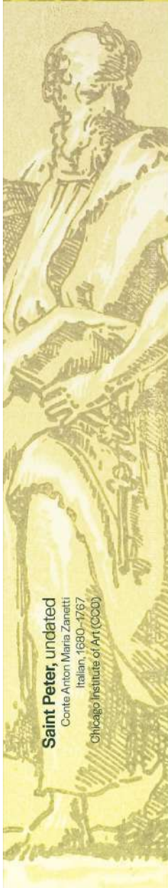
Saint Peter, undated Conte Anton Maria Zanetti Italian, 1680-1767 Chicago Institute of Art (CICAI)

Twenty-first Sunday in Ordinary Time August 23, 2020