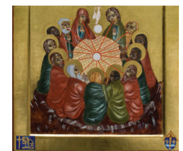
Happy Pentecost Sunday!

412 W. 4th Street • P.O. Box 133 Carver, MN 55315 952-448-2345 952-368-0502 Fax www.stnicholascarver.org